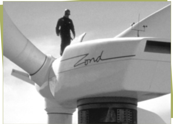
High tech wind turbines are much larger than the old windmills you are used to seeing in the country side. Zond is a major manufacturer of wind turbines operating on Minnesota wind farms.

Other production of wind-generated electricity comes from turbines of less than 40 kW capacity that are owned and operated independently by individuals or groups. In 1999, utilities reported that these smaller turbines produced sales totaling 642 MWh, with the output coming from 99 facilities in rural areas, mostly farms.